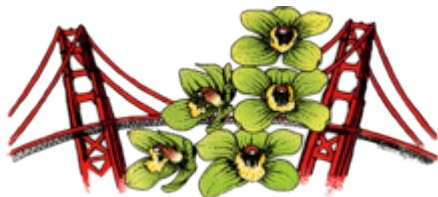
Golden Gate Cymbidium Society