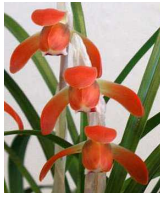
Cymbidium goeringii 'Benitemari'