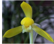
Cymbidium goeringii 'Kohakuden'